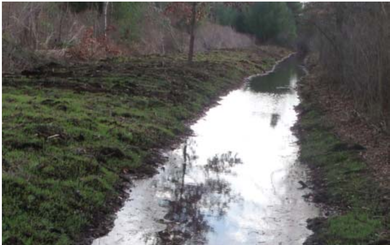
Orient-Fork Intercounty Drain

Fork Township, Mecosta County and Orient Township, Osceola County